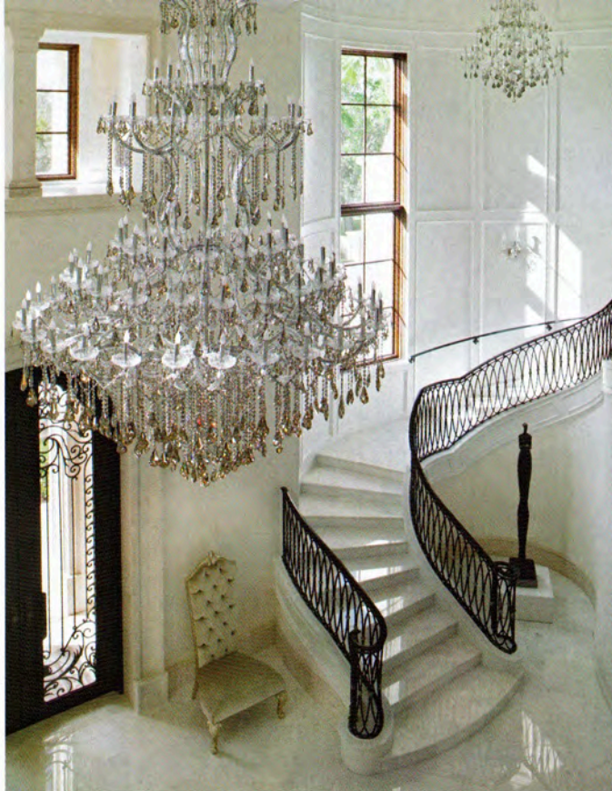
A pair of crystal chandeliers and a marble stairway with a custom black iron railing highlight the grand foyer.

In the living room, a velvet-type chenille tufted sofa from Phyllis Morris of Beverly Hills is accented with bright throw pillows. Hand-forged solid bronze and brass lamps were made in France.